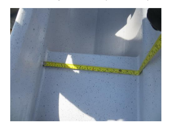
All seats are approximately 37.5cms wide

At 90cms length, the cockpit is roomy front to back.