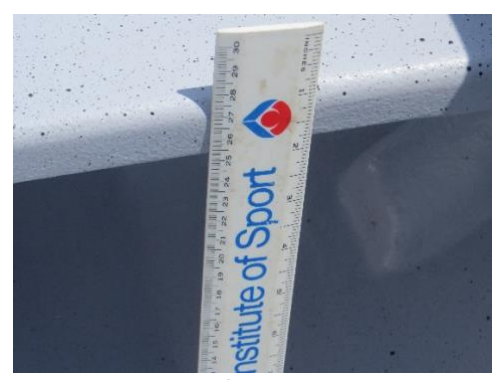
Height of the seat will vary with curve of the hull, but is approx. 27-28cms.

For all paddlers who use bespoke support seats , the organisers have given an assurance that they are willing to drill 4 holes in selected seats so that a support seat can be bolted firmly in place . It is proposed to provide 4mm fixing holes spaced 20cm apart laterally and 20cm longitudinally, and 4mm bolts with quick release wingnuts are recommended .