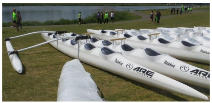
This was the boat used for the Dorney Championships

The V6 for the Distance Championships 2023 is the 'ARE Matahina'.