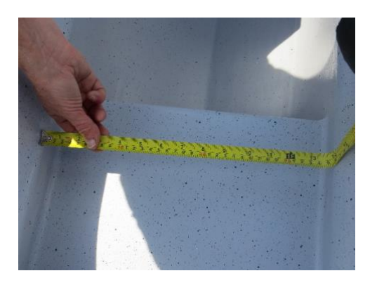
Just below hip height, this reduces to about 35cms